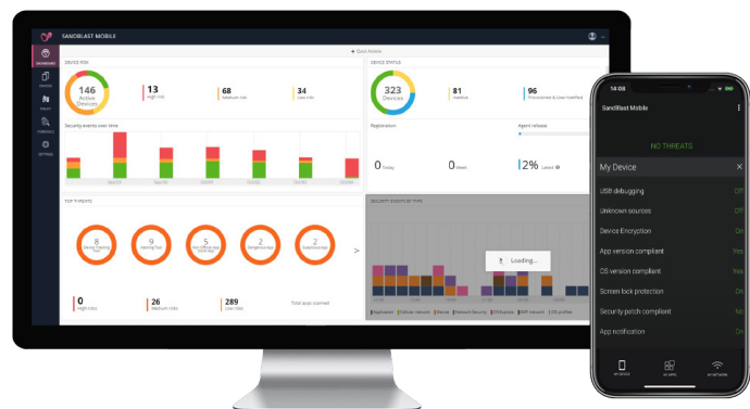
Harmony Mobile Management Console